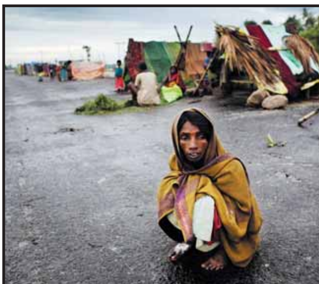
This Dalit community is displaced by the floods in Bihar, India. NCDHR documented how Dalits were grossly discriminated in the distribution of emergency relief to victims of the July 2007 floods.