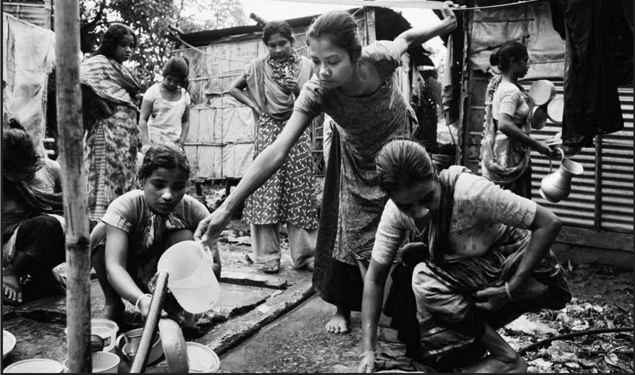
Dalit Women attending to their chores. Houses in this Dhaka slum are so small that daily life is lived in the streets, leaving little privacy.

a demand for a national campaign to eradicate untouchability and atrocity practices. It was presented to the President, the Prime Minister, concerned ministries, the National Human Rights Commission (NHRC) and the National Committee on Scheduled Castes (NCSC). Meetings with the National Commission for Scheduled Castes were also organised on the growing number of atrocities against Dalits and the serious lapses in the implementation of Scheduled Castes/Scheduled Tribes Prevention of Atrocities Act (SC/ST POA). Several consultations were organised with members of the National Human Rights Commission and more than 50 Dalit organisations.