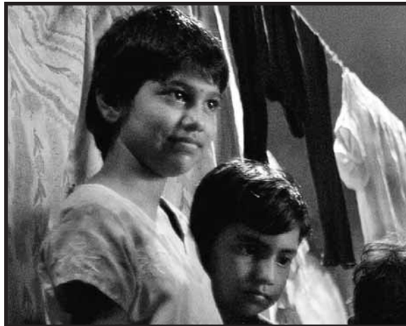
OELRICH GRAFISK DESIGN TRYK: SANGILL GRAFISK, 2008