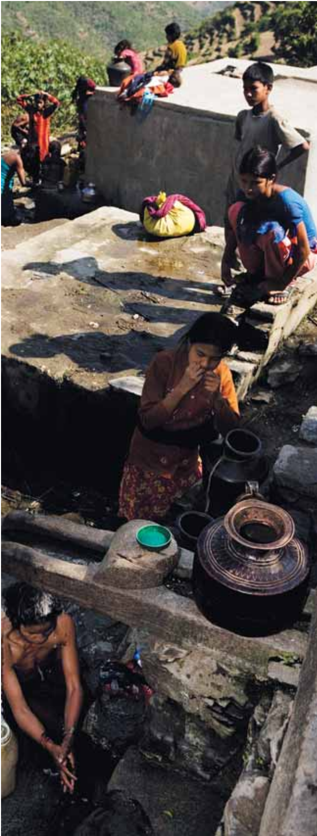
The village development committee has build separate water taps for Dalits and non-Dalits in Tikapir Kailali village in the far Western Province of Nepal, and as a result the development efforts perpetuate patterns of caste discrimination.